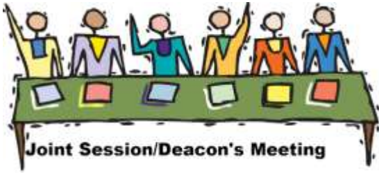
Joint Session/Deacon's Meeting